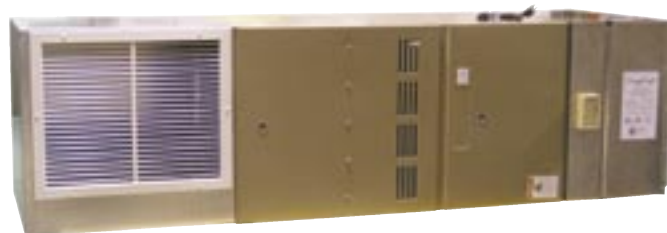
EnergyCraft Heating Appliance