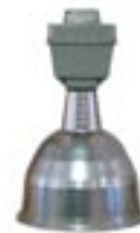
EnergyCraft Lighting Appliances