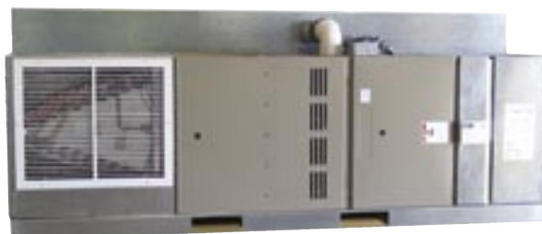
EnergyCraft Heating/Cooling Appliance