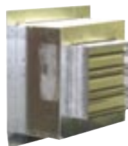
EnergyCraft Fans and Louvers